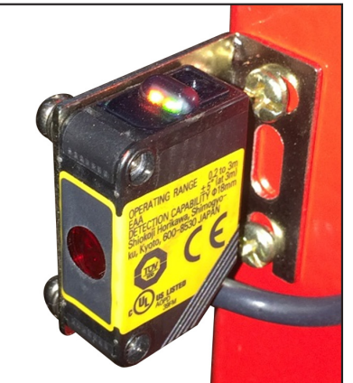
Power on & aligned