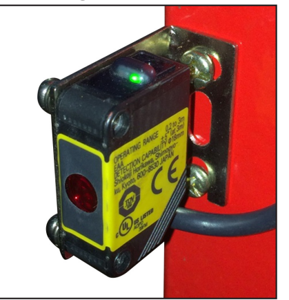
Power on & not aligned